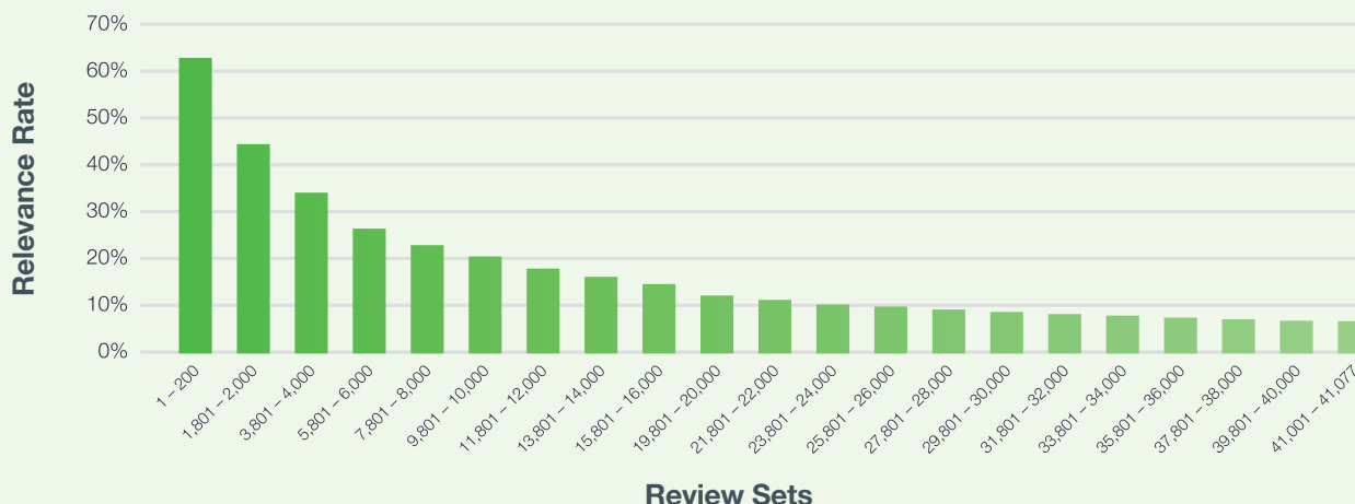
Overall Mean Relevance rate

The below graph illustrates how using active learning enabled the review team to review the most relevant documents sooner.